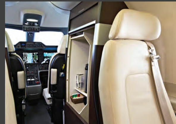
4 PASSENGER SEATING CONFIGURATION